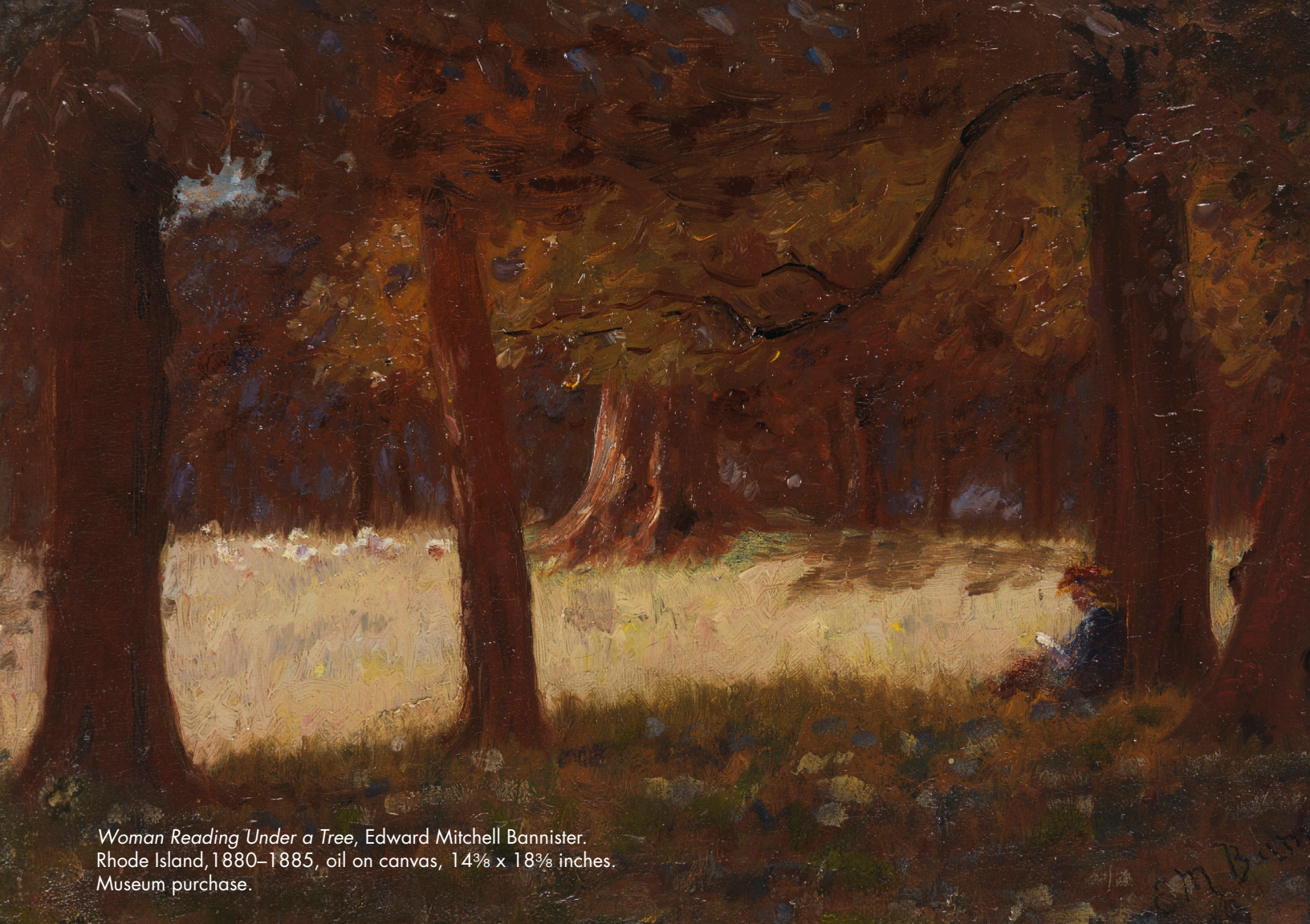
Woman Reading Under a Tree , Edward Mitchell Bannister. Rhode Island, 1880–1885, oil on canvas, 14 \frac{3}{8} x 18 \frac{3}{8} inches. Museum purchase.