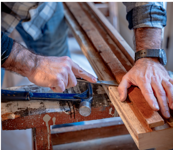
Accessibility modifications at Pierce House, Dorchester, MA

The campaign aims to expand capacity, deepen public engagement, and secure the legacy of New England's rich history for future generations.