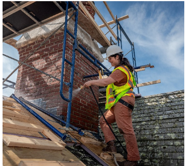
Chimney repair at Beauport, the Sleeper-McCann House, Gloucester, MA

The impact of our preservation advocacy is experienced through our Preservation Easement Program, broadly recognized as the gold-standard for protecting private properties in perpetuity through strong partnership and legal frameworks. We will maintain our unyielding commitment to expanding and defending this program in the face of increasing local and national challenges to preservation policy. Leveraging our distinctive leadership and preservation expertise, we will also continue to bring our voice as preservation advocates to key issues to build awareness and support for our work, and to ensure that preservation is considered as a critical element to the livability and vitality of the region and beyond.