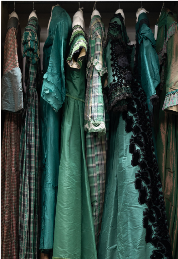
Textile collections in Haverhill

By transforming our Haverhill, Massachusetts, campus—now comprised of two historic manufacturing buildings and three vacant parcels all located at the doorstep of the commuter rail and Amtrak in an urban historic district—Historic New England contributes to the revitalization of a historic downtown, while creating a cultural heritage and exhibition center, a destination for visitors, and being part of a vibrant community.