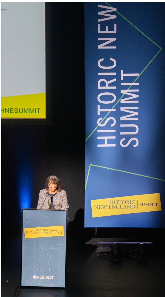
Historic New England Summit in New Haven, CT

The New England Plan 2030, like its predecessor plan, mandates that Historic New England continue to advance the impact of its communications with exciting new initiatives across the region.