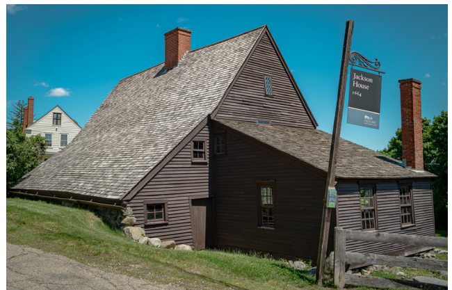
Jackson House, Portsmouth, NH

We are steadfastly committed to making our sites destinations of choice through creative, innovative, and inclusive experiences for all, including expanded physical accessibility at our museums and properties.