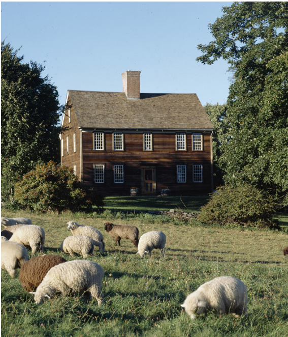
Watson Farm, Jamestown, RI

The care of thirty-eight properties, plus our Haverhill Center and some of the region's most iconic historic homes and farms, reflects the heritage of the organization and a tradition of excellence that we continue to uphold. We look to the next five years to resolve deferred maintenance at our sites, and to raise the level of care for our landscapes as we look to activate more outdoor space. We will support the core tenets of our Climate Action work by increased exploration at the intersection of preservation and resiliency, including reducing our institutional carbon emissions by 25 percent.