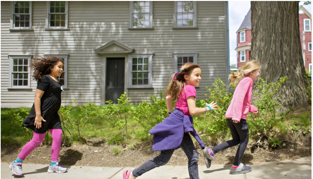
Students at Pierce House, Dorchester, MA

In 2024, Historic New England embarked on the first phase of its $300 million, ten-year comprehensive campaign to preserve and elevate our extraordinary historic resources and expand engagement in our public history mission.