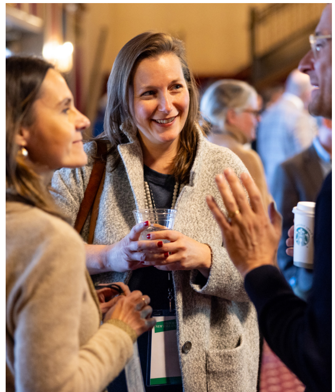
Summit attendees in Providence, RI

New experiences and exhibitions are supported through innovative communications strategies, and The Historic New England Summit, with its own breakthrough launch in 2022, has become the region's leading annual conference in historic preservation, reasserting Historic New England's leadership role in developing a more expansive vision for the field.