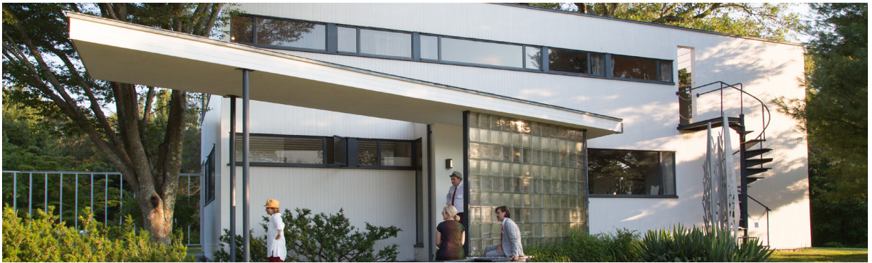
Cropius House, Lincoln, MA

Recovering New England's Voices, our landmark visitor engagement program led by the Historic New England Study Center, is now in its fifth year. It continues to transform how visitors experience the region's history through our museums, collections, and programs.