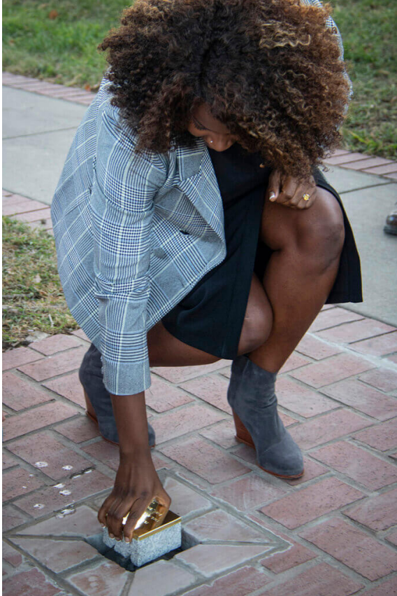
Stopping Stones installation

With the recent addition of the Stopping Stones program, which honors and shares the lives of enslaved individuals across our communities, we further expand the stories we provide and the connections we make.