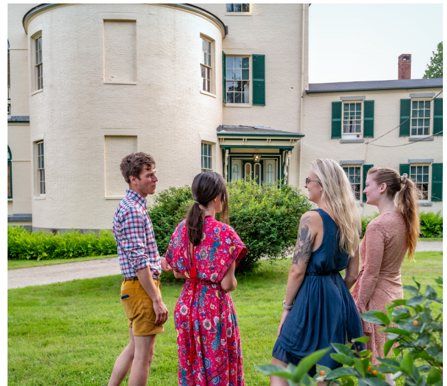
Castle Tucker, Wiscasset, ME

Looking to the future, Historic New England is committed to identifying new museum properties, as well as promising partnerships, to expand the diversity of the museum experience in support of our inclusive public history mission.