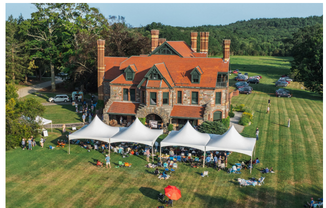
Eustis Estate, Milton, MA

Looking to the future, Historic New England is committed to identifying new museum properties, as well as promising partnerships, to expand the diversity of the museum experience in support of our inclusive public history mission.