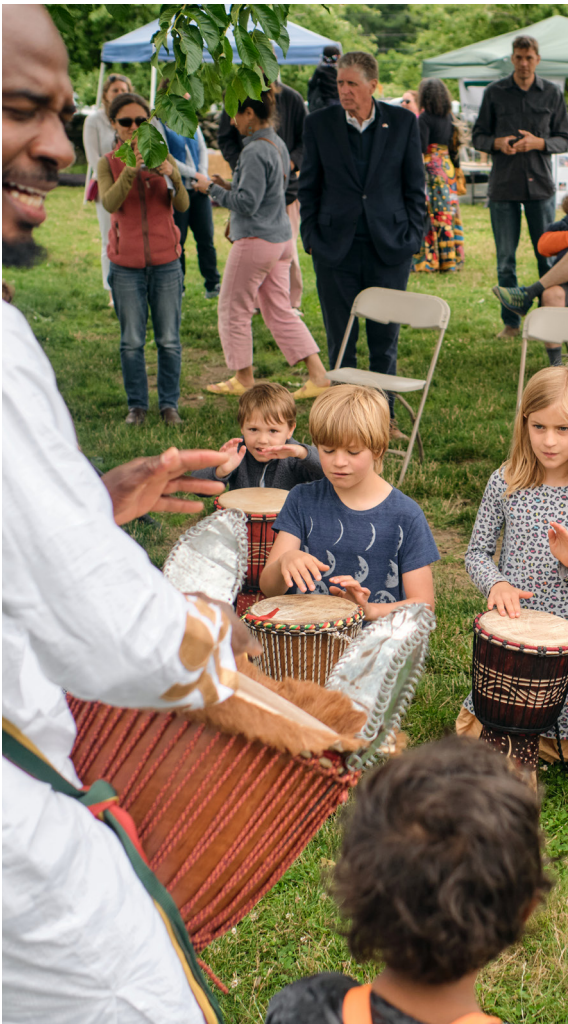
Rhode Island Slave History Medallion Dedication, Casey Farm, Saundertown, RI

The vitality of the institution's museums is the primary lens for resource planning, and the commitment to integrate and synthesize historic houses, landscapes, and collections inspires endlessly engaging and powerful programs to share with the public.