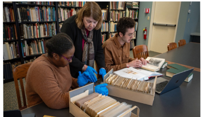
Library and Archives in Boston, MA

A compelling, revitalized Historic New England presence in downtown Boston will be another dynamic anchor, complementing the Haverhill Center. Together, they provide an unparalleled opportunity for an introduction to all thirty-eight of our exceptional museum sites and outstanding collections, reflecting hundreds of years of life in New England.