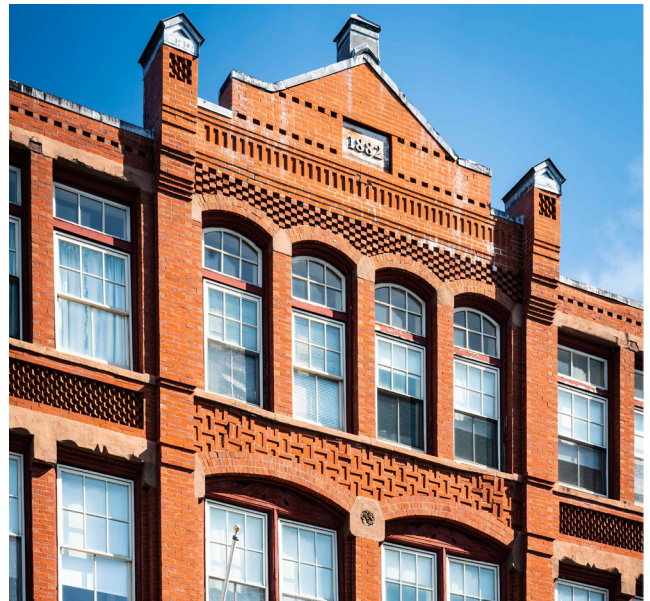
Downtown Haverhill, MA

We are committed to optimizing the Haverhill Center as a destination for discovery, public programming, and education, and to being a collaborator and vital partner in the revitalization of the city.