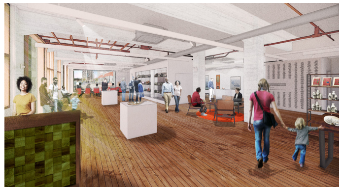
Rendering of the Welcome and Exhibition Center (designLAB architects)

We are committed to optimizing the Haverhill Center as a destination for discovery, public programming, and education, and to being a collaborator and vital partner in the revitalization of the city.