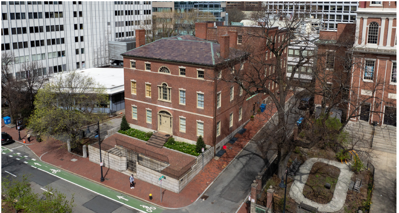
Otis House, Boston, MA

Efforts are underway for the renovation of Otis House on Cambridge Street in downtown Boston. First restored one hundred years ago, Otis House underwent a groundbreaking interior restoration in the 1970s and is now poised to start a new chapter.