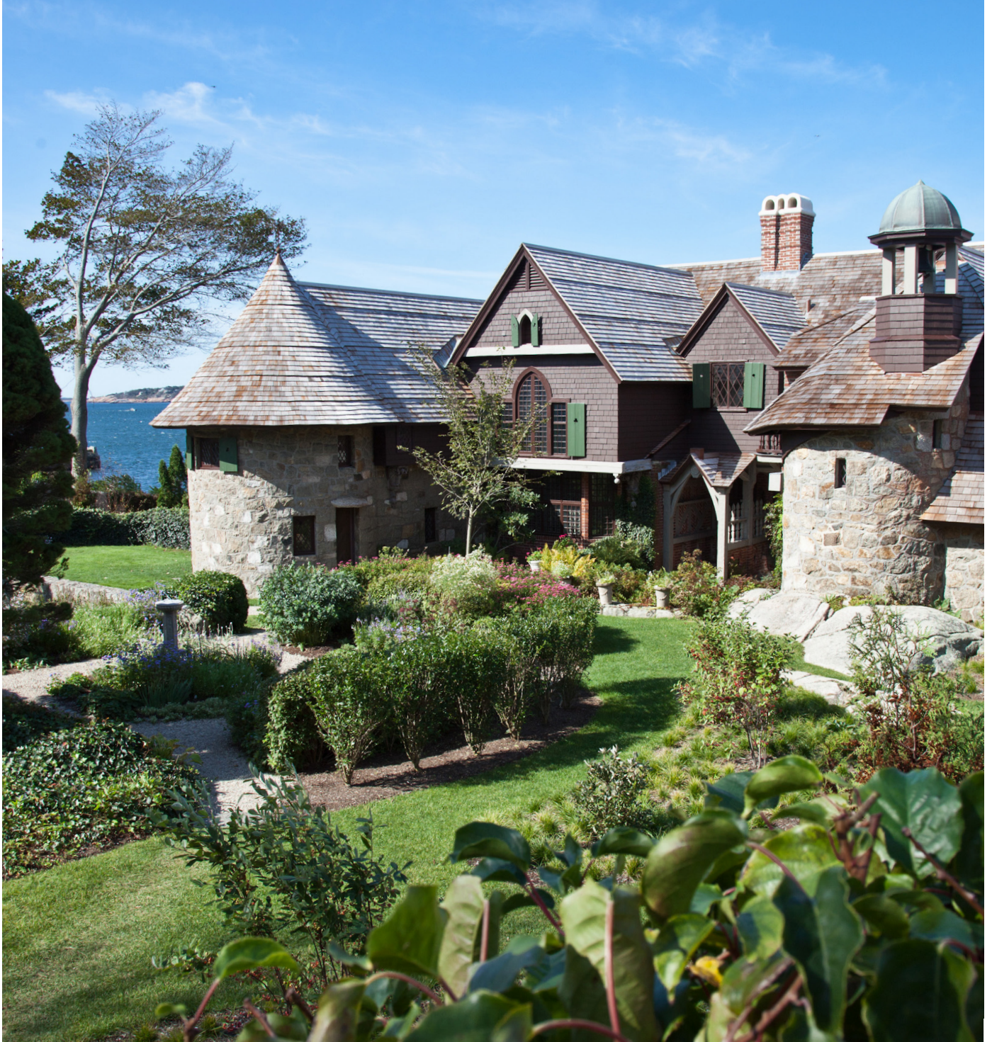
Beauport, the Sleeper-McCann House, Gloucester, MA

Building on five years of significant investment and tremendous progress since our last plan, the following seven strategic initiatives are central drivers of both The New England Plan 2030 and The Campaign for Historic New England .