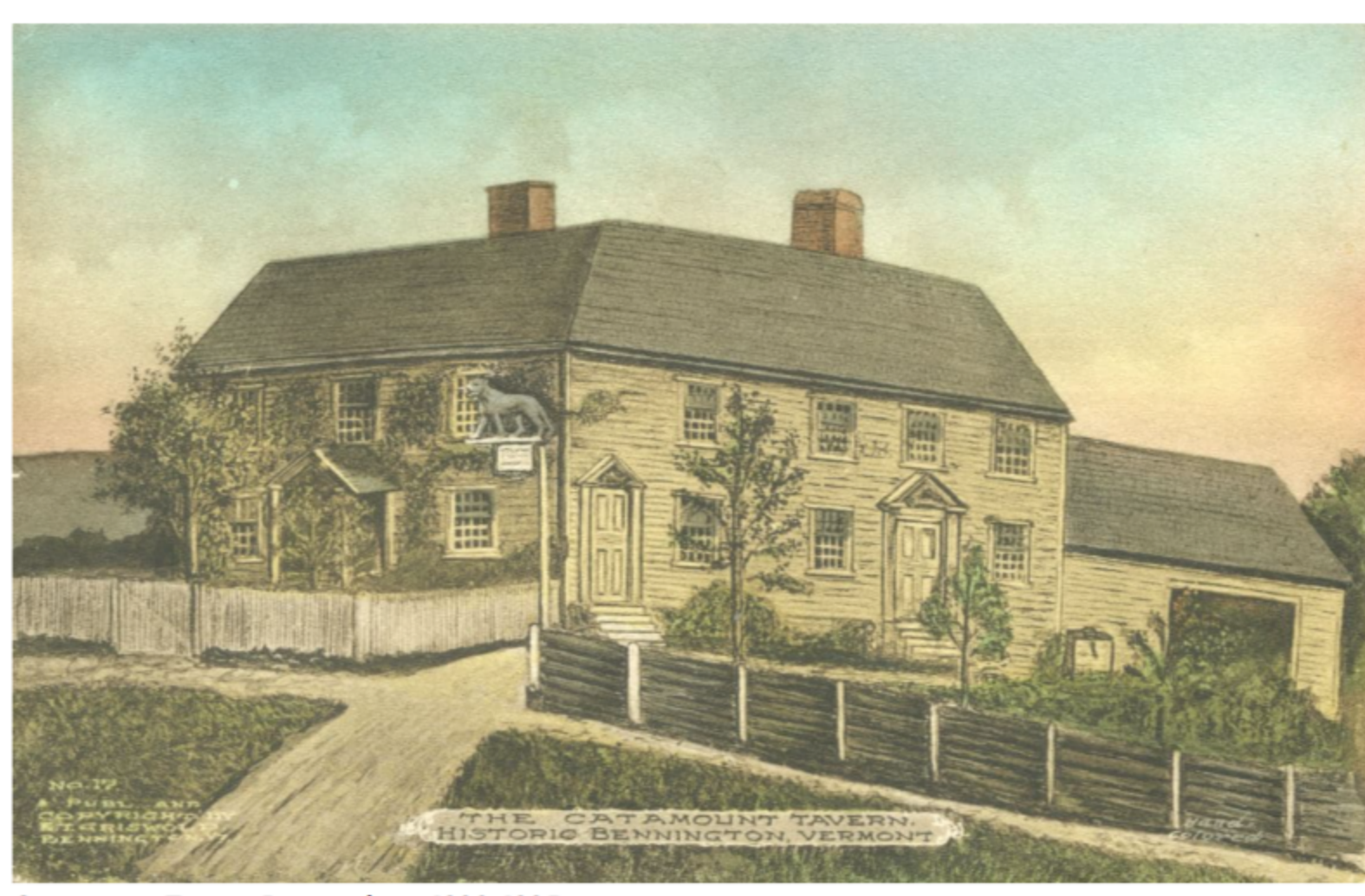
Catamount Tavern Postcard, ca. 1920-1925